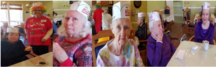
Valentine's Day & Southwest Elem. Kendergarders