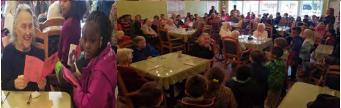
Treble Makers Bring Sweet Smiles