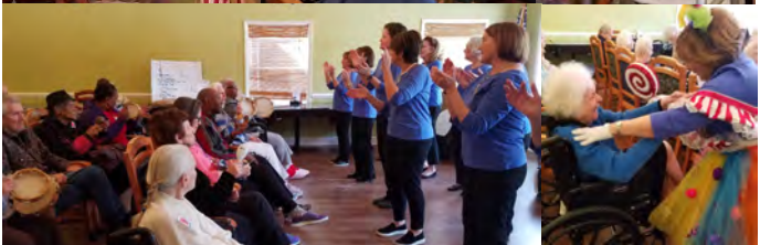
DAR Sharing the love with our Veteran's for Valentine's